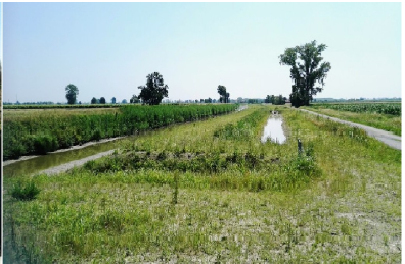
Collettore Alfieri after works (june, 2016)

Currently, works were completed on the first two, and is at an advanced stage on the third site. It was thus the behaviour of restored canals can be enjoyed during the floods of last spring, checking for proper hydraulic operation of the interventions.