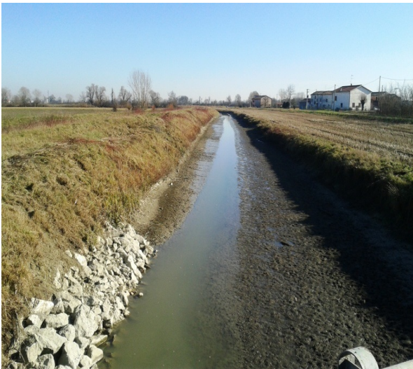
Collettore Alfieri canal before the works

After completion of the design phases, in the past months construction sites for restoration along the Collettore Alfieri, Collettore Acque Basse Modenesi (C.A.B.M.) and Diversivo Fossa Nuova Cavata canals were started.